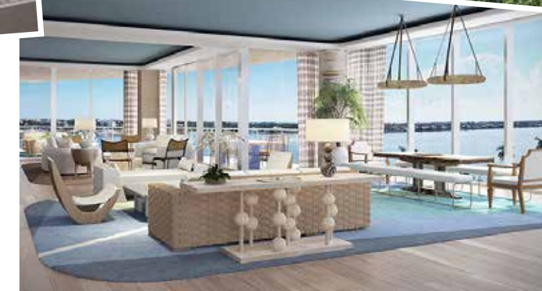
This page, clockwise from above: Each residence at Forté features floor-to-ceiling windows and expansive balconies with views; the pool area; a spacious living room; the entrance of Forté. Opposite page: Forté is a 24-story tower developed by Two Roads Development.

OVERLOOKING PALM BEACH from South Flagler Drive, Forté, a 24-story tower developed by Two Roads Development, enjoys sweeping views of Worth Avenue, the Intracoastal Waterway, and the Atlantic Ocean. Forté offers a collection of 41 flow-through residences, starting at $6.7 million, each with private elevator foyers, dramatic ceiling heights, floor-to-ceiling glass windows, and expansive balconies that provide 1,000 additional square feet of outdoor living. With only two residences per floor, each unit comes with customizable kitchen floor plans appointed with the finest modern finishes, features and appliances.